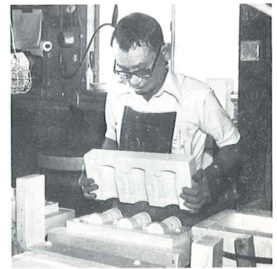
(8) Making a Mold