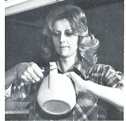
(4) Trimming with knife.