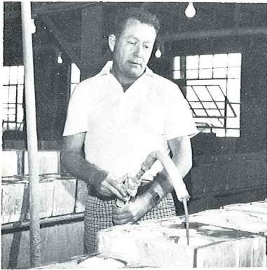
(1) Slip Casting