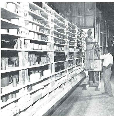
(7) Stacking kiln for firing.