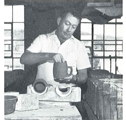
(2) Removing piece from mold.